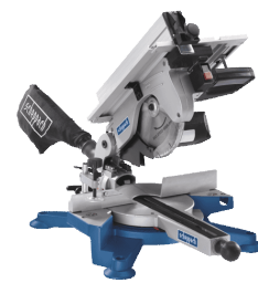
Table-Mitre Saw HM100T scheppach - 220-240V 50Hz 1800W