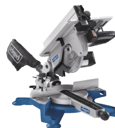
Table-Mitre Saw HM100T scheppach - 220-240V 50Hz 1800W